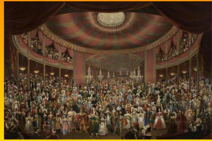
A Fancy Dress Ball, Manchester, painting by Arthur Perigal the elder. 1828.